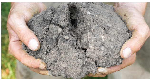
Before Love Your Soil

60 lb. Bag covers 17,000 sq. ft. Product #12228