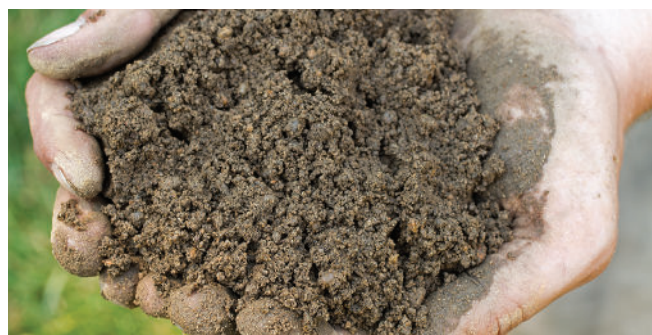
After Love Your Soil

(typical results may take 3 to 4 applications depending on soil conditions)