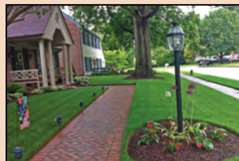
Photos of real Black Beauty lawns.