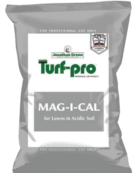
60 lb. Bag covers 17,000 sq. ft. Product #12229

Calcium is present in most soils. It makes up about 4% of the earth’s crust. Calcium is essential for many grass plant functions, especially cell division, cell elongation, cell wall development, nutrient uptake, enzyme activity, and plant metabolism. Calcium is not very mobile in the soil and often forms insoluble compounds with other elements. Therefore, a continuous supply is essential for the development of a healthy, attractive lawn.