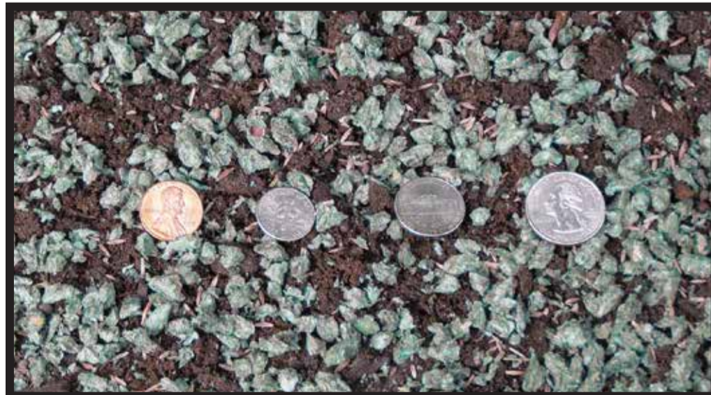
Proper coverage for Lawn Repair

Mow the lawn short and remove dead grass and debris from area to be seeded. Rake the soil to create a loosened seed bed. Shake the bag prior to application of this product. Spread Lawn Repair on the loosened soil and rake lightly to achieve even coverage, see example of proper coverage in the picture to the right. It is important to water the seed bed for sufficient germination of the grass seed and expansion of the mulch to provide soil coverage. Water area daily for one to two weeks, then water once a week, or as needed when mulch dries out. New grass should start to germinate in 10-14 days. Seed germinates once soil temperatures reach 55°F. Lawn Repair mulch will eventually bio-degrade into the soil.